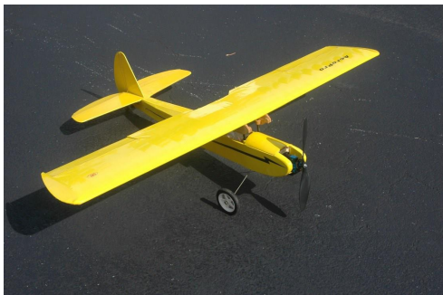
SR Batteries Cutie. 46 " ED, geared brushless, 4 channel. A fun plane to fly. I may keep it.