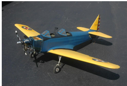
P-19, 80" WS. Powered by OS/120. Color matching cowl Nelson glow driver