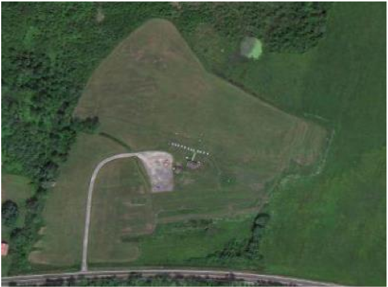
STARS Field Satellite photo