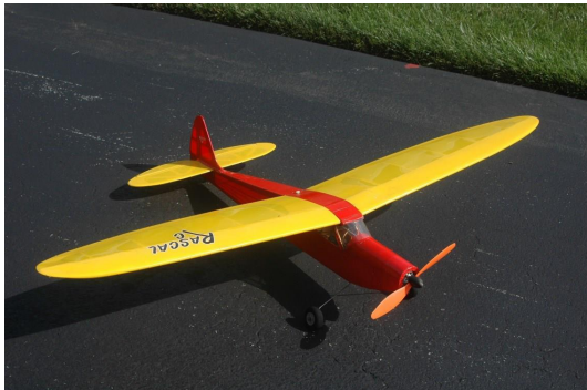
A Sig Racal C, 47" ws, three channel, out runner motor. Removable wing. Fun little toss around the sky plane. Needs 2S1200