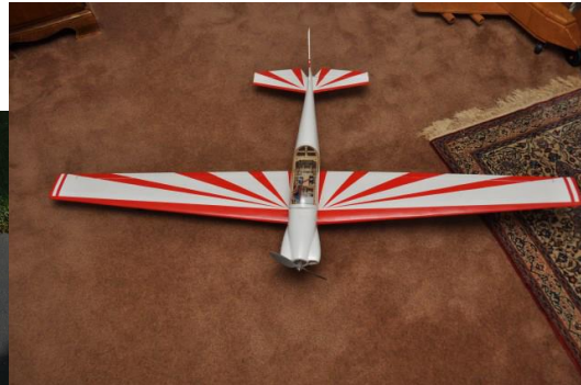
Model of Fournier RD-4, I think. Motor glider, 4 channel, perhaps 50" ws. Out runner. Needs 3S1600 LiPo