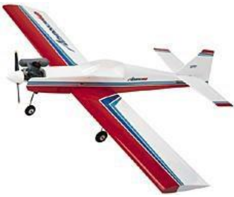
Hangar 9 Advance 40, 60" ws, Trike gear sport plane Enya 54. Mfg photo but mine is almost identical Airtronics black electronics