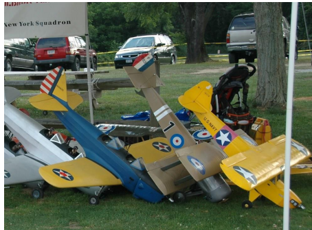
The biplane is a Sopwith, pperhap Strutter. Gas powered, 60 wing span Note also the PT-19 with cowl