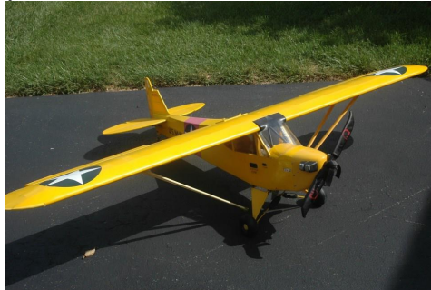
Great Planes Cub ARF. 80" WS. Glow powered w McDaniels glow driver