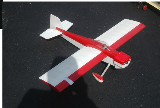
Lanier Stinger 10, 4 channel, 36" wing span. Out runner motor available with it.