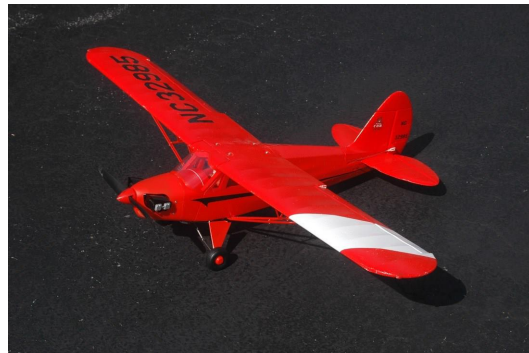
Hobby Lobby J-5. 43" ws, EPO foam construction. Minor LG damage. Flies on 2S1600 LiPo ; 2 included