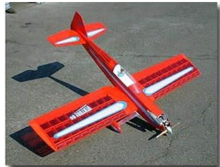
BTE Venture 60. A sweetheart of a plane. Glow, Enya 74? Mine is covered similarly. 72" ws Airtronics black electronics