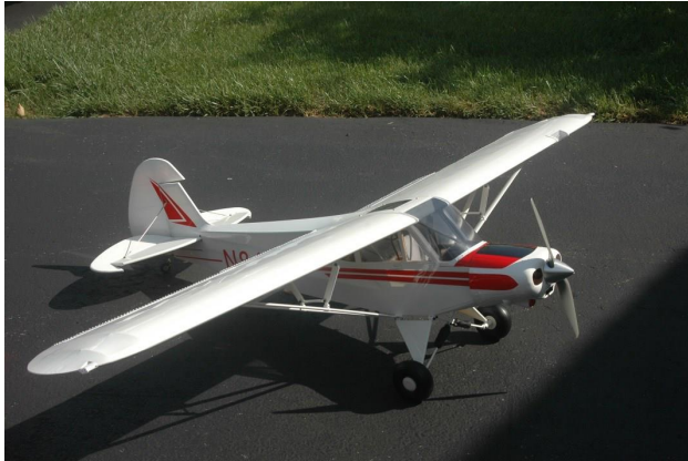
Electifly Super Cub. 68" electric. Flown only for MAN review. 5 channel, inc. flaps. Uses 4S 3200 mAH LiPos